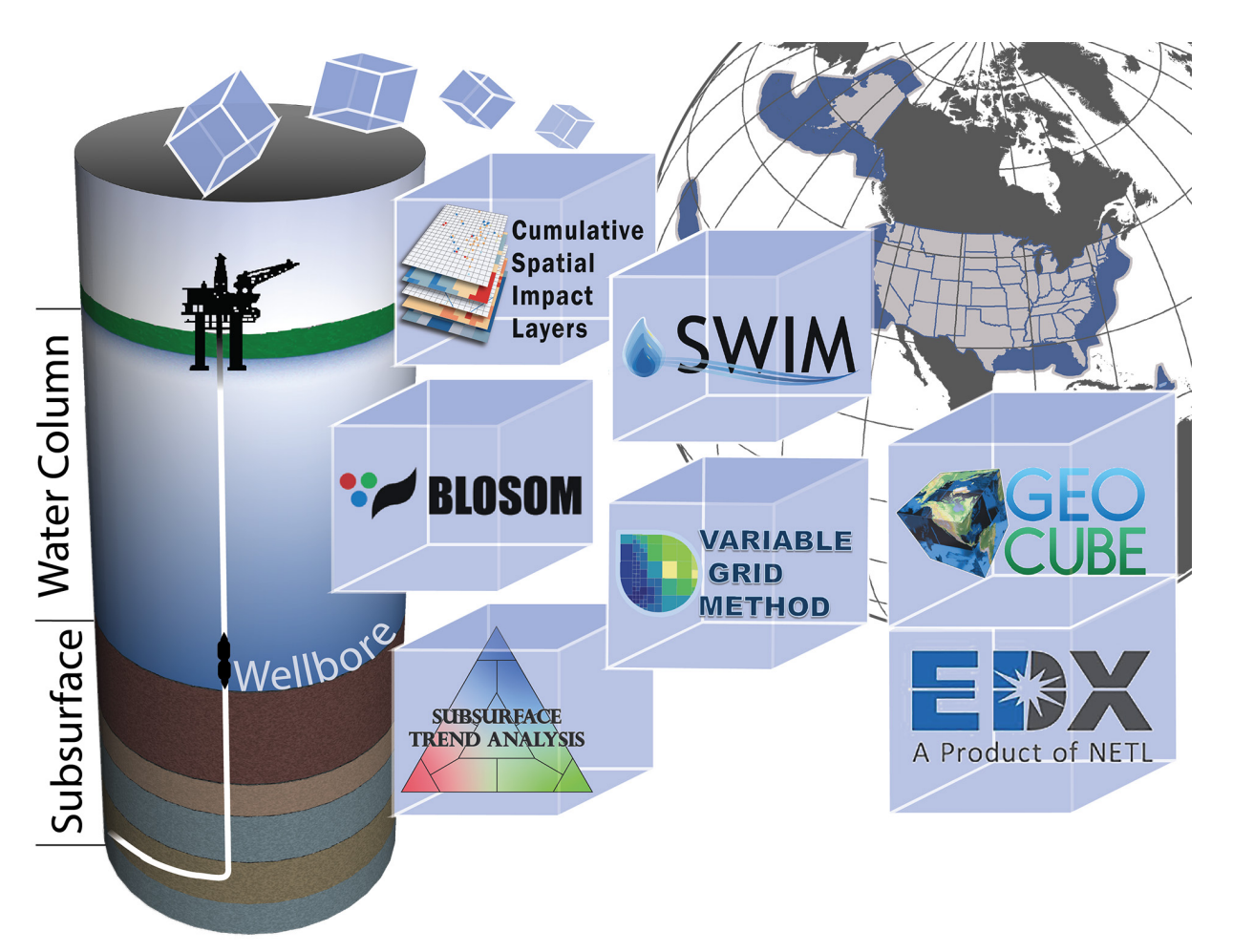
Figure 1, Example worst case discharge analysis using a combination of the Offshore Risk Model capabilities. Forecast and analysis using hypothetical spill simulated using BLOSOM (gray scale) and potentially impacted resources assessed and analyzed using CSIL, SWIM, EDX and Geocube served information. Helps assess vulnerabilities to environment, transportation, tourism, and other factors as well as risks and costs to operations.

In addition, data has been used to develop five sciencebased, data-driven tools and models for the ORM to support the evaluation and reduction of risks and uncertainty associated with extreme offshore hydrocarbon development (Figure 1). These five tools and models address concerns or needs from the subsurface, wellbore, and water column to evaluate relationships, trends, risks of offshore spills, and uncertainty.